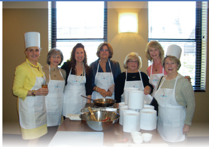
Guests enjoy lunch at the spring meeting and installation.

Barnes-Jewish Hospital Auxiliary 1001 Highlands Plaza Drive West, Ste. 140 St. Louis, Missouri 63110