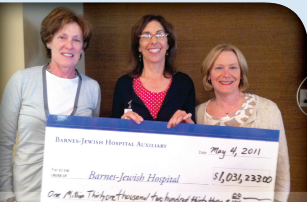
The annual Auxiliary check presentation to The Foundation for Barnes-Jewish Hospital.