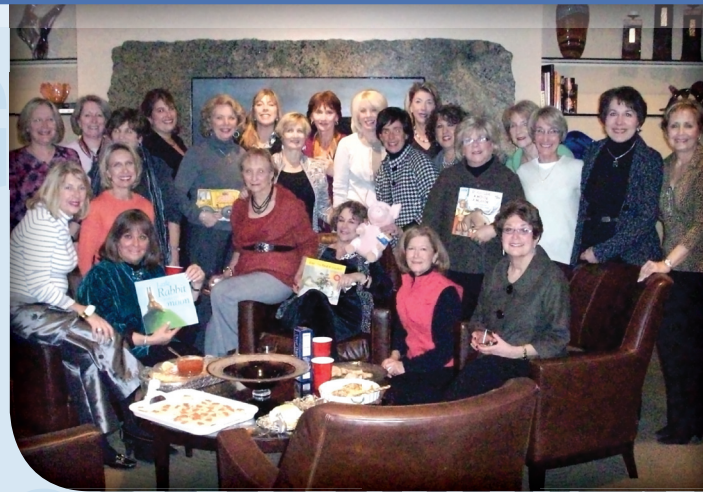
Book clubs are just one way you can get involved in the Auxiliary.